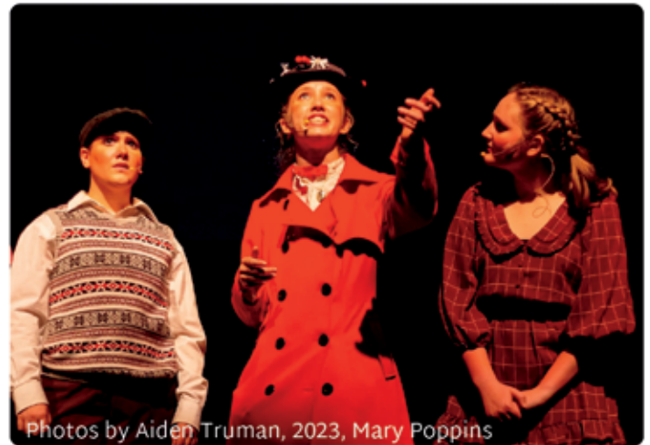
2023, Mary Poppins

"I have seen students break out of their shell and surprise themselves onstage," she says. "Students who are shy or think they can't do something end up doing amazing when they get on the stage. I think that really boosts the confidence of students."