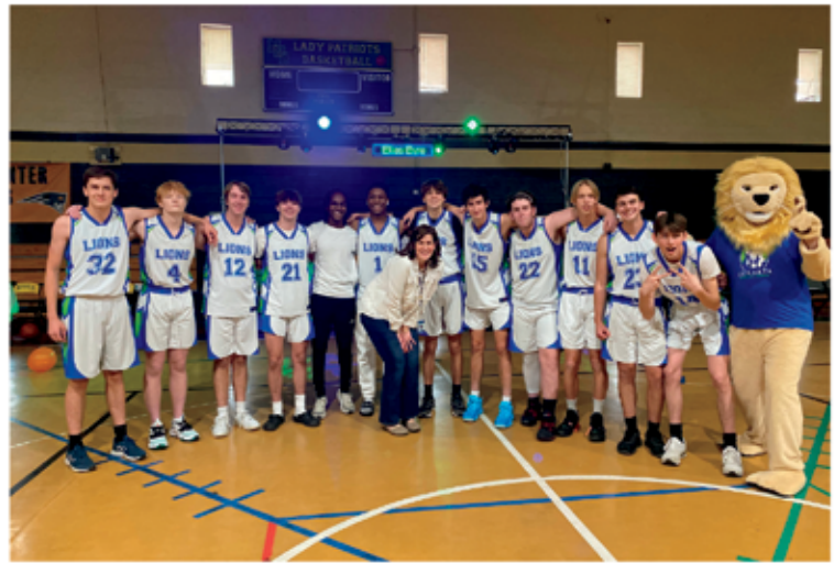
Boys Basketball Team, 2023