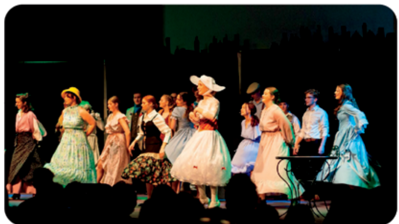
2023, Mary Poppins

Beacon Hill boasts a new space for new growth with clients