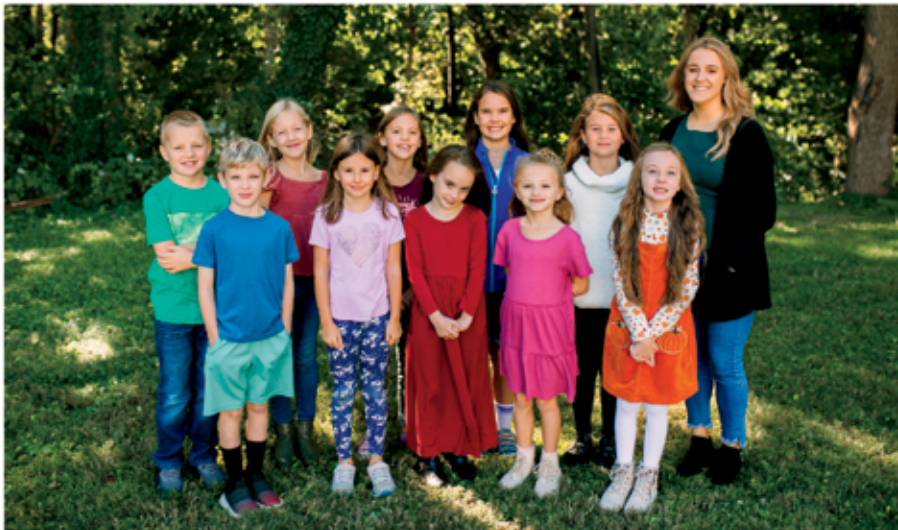
Scholé 2nd and 3rd Grade Class

Scholé teachers instruct students each Tuesday and Thursday, and assign work to be completed at home the other days of the week. While Pre-K through 6th grade students are encouraged to use Wednesdays as a day to enjoy family outings, music lessons, and/or child-directed learning, many of our middle school students attend the Academy on Wednesdays to participate in extracurricular activities. Scholé students are eligible to participate in testing, tutoring, athletics, dances, and other celebrations at ECA.